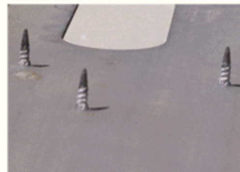
Driven through 16 gauge metal