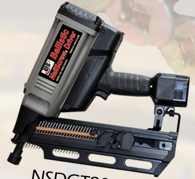
NSDGT9021FRH Gas Tool

NailScrews® cause minimal damage to materials allowing materials to be reused.